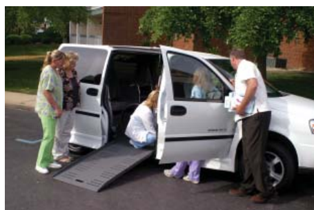
Above: Eden staff members receive instruction on how to operate lift machinery in the new van.